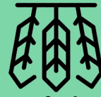
Loss of cultural identity