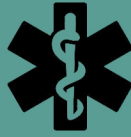
Drug treatment programs