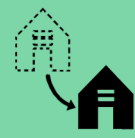
Displacement & Dispossession