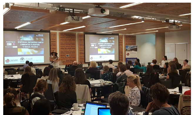
Empowering Campus Communities to Respond to Sexual Violence Symposium

On June 1, 2017, The ICCLR, in partnership with the AMS Sexual Assault Support Centre (SASC), hosted a one-day symposium on promising practices in sexual violence prevention and response on post-secondary institutions, as well as how institutions can empower victims and survivors of sexual violence to continue to thrive and participate in higher education after their experiences. Post-secondary institutions had spent the greater part of the previous year forming committees, developing drafts, and seeking public consultation in order to meet the deadline for creating their standalone sexual misconduct policies. The events provided a timely opportunity for BC's institutions to come back and share their progress, strengths, weaknesses and evidence-based strategies and to create a community of practice for sharing knowledge and resources in a sustainable way. This symposium built upon three earlier events co-hosted by the ICCLR, AMS SASC, and the Ending Violence Association of British Columbia (EVA BC)