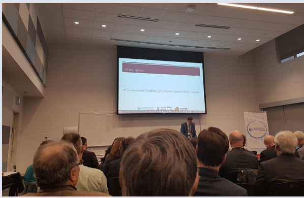
Making Progress Against Corruption Colloquium held on December 1st, 2017

In December 2017, the Centre collaborated with Transparency International Canada to host a joint colloquium titled “Making Progress Against Corruption”. The event represented a conclusion of more than one year of substantive and capacity-building events in British Columbia, geared towards the emergence of an active, multi-sectoral anti-corruption community in the region with strong national and international linkages. Our goal for the event was to identify key gaps and priorities, generate and support effective action against corruption, and enhance knowledge and awareness of these issues; and in doing so, strengthen and expand a regional network of supporters and experts committed to the fight against corruption. The colloquium was attended by over 80 participants from a diverse range of sectors including law, government and academia. Opening remarks were also provided by The Honourable David Eby, Q.C., the current Attorney General of British Columbia.