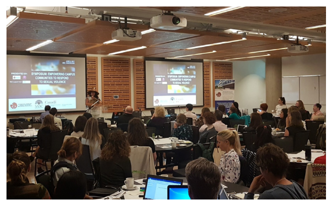
Empowering Campus Communities to Respond to Sexual Violence Symposium

On June 1, 2017, The ICCLR, in partnership with the AMS Sexual Assault Support Centre (SASC), hosted a one-day symposium on promising practices in sexual violence prevention and response on postsecondary institutions, as well as how institutions can empower victims and survivors of sexual violence to continue to thrive and participate in higher education after their experiences. Post-secondary institutions had spent the greater part of the previous year forming committees, developing drafts, and seeking public consultation in order to meet the deadline for creating their standalone sexual misconduct policies. The events provided a timely opportunity for BC's institutions to come back and share their progress, strengths, weaknesses and evidence-based strategies and to create a community of practice for sharing knowledge and resources in a sustainable way. This symposium built upon three earlier events cohosted by the ICCLR, AMS SASC, and the Ending Violence Association of British Columbia (EVA BC)