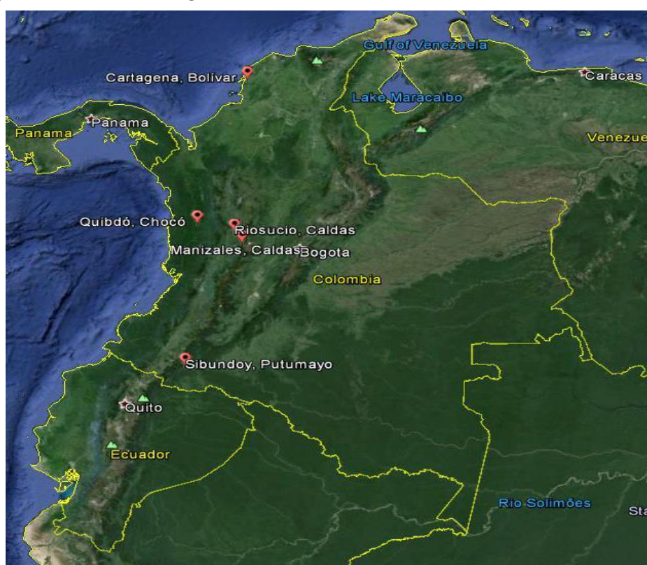
Map 1. Map of Colombia, showing four sites of field research

Note: The map is stylized and not to scale. It does not reflect a position by UNICEF on the legal status or any country or territory or the delimitation of any frontiers.